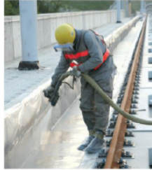
Figura 12.8.4.2.6.a - Applicazione a spruzzo della membrana impermeabile

explaining technical details and the logical structure of procedures, often substituting written descriptions. This means that the model frequently needs to interpret these visual elements without relying on explanations provided in the text.