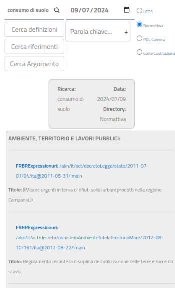
Figure 2: The first results of our search by topic system. Using the query “land consumption” in Italian on the Normattiva dataset, the system returns the appropriate Camera commission (environment, territory and public works) and the first two results are relevant (one is about waste management, the other about rocks and earth from excavation projects).