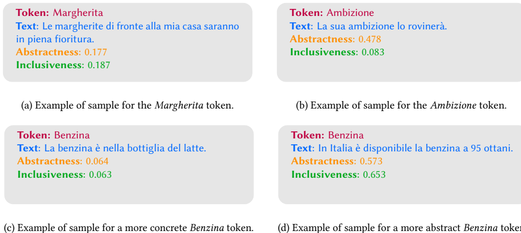
Figure 1: Examples from the abricot dataset.

of the ideas (namely, only colorless green ones), while the reference in 2b shows a higher level of inclusiveness, not distinguishing among them on the basis of their color.